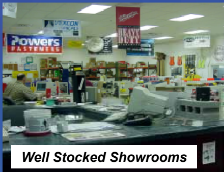
Well Stocked Showrooms